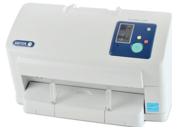
LEFT The Xerox DocuMate 5460 offers super-speedy scanning, delivering 60 pages per minute

while language settings are changed and/or software is restarted? With Xerox document scanners and Dokmee Capture, it's possible to scan documents in any two of 165 supported languages, with the OCR systems switching from one to the other on the fly. One scanner and one workstation can serve two languages, cutting down on hardware and software investments, headcount and operating costs.