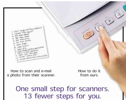
1998 Visioneer OneTouch Ad

In 1998, Visioneer changed the way that users interacted with their scanners. Previously there were multiple steps to scan a document or photo. Launching software, setting resolution, paper size, prescan, color depth, cropping, saving, etc. And the average user who was not skilled in scanner or imaging technology had no idea how or why to make these choices. So any scanning task took up to 14 steps and some techno-savvy. Enter Visioneer OneTouch . Visioneer created buttons on scanners that let the user scan with one touch to already configured settings for different applications: scan a photo, scan to email, scan to the printer (copying), etc. Before you knew it, everyone starting putting buttons on scanners. Why? Because ease of use was more important than any other feature including price. The steak is more important than the sizzle.