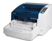
Xerox® DocuMate® 4799 scanner

For more information about the Xerox line of scanners, visit www.xeroxscanners.com