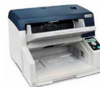
Xerox® DocuMate® 6710 scanner