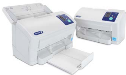
The Xerox® DocuMate® 5445 and DocuMate 5460 scanners.

Offload image processing to the scanner itself and remove the need to overburden the workstation. Performing IP at the scanner level using On-Board Acuity hardware-based image processing allows users to scan images and apply specialized image enhancing processes with no slowdown to the scanning speed or transfer and delivery of image data to the scanning application. In other words, Xerox® DocuMate® scanners with On-Board Acuity now go “up to eleven”.