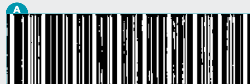
Figure A: very small barcode scanned at 200 dpi without any enhancing applied.

*Other Bi-tonal Acuity features such as edge removal, automatic rotation, image stacking, etc. are still supported via software processes.