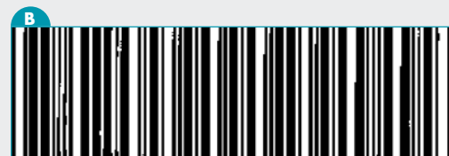
Figure B: The same barcode scanned at 200 dpi using the improved line smoothing process.